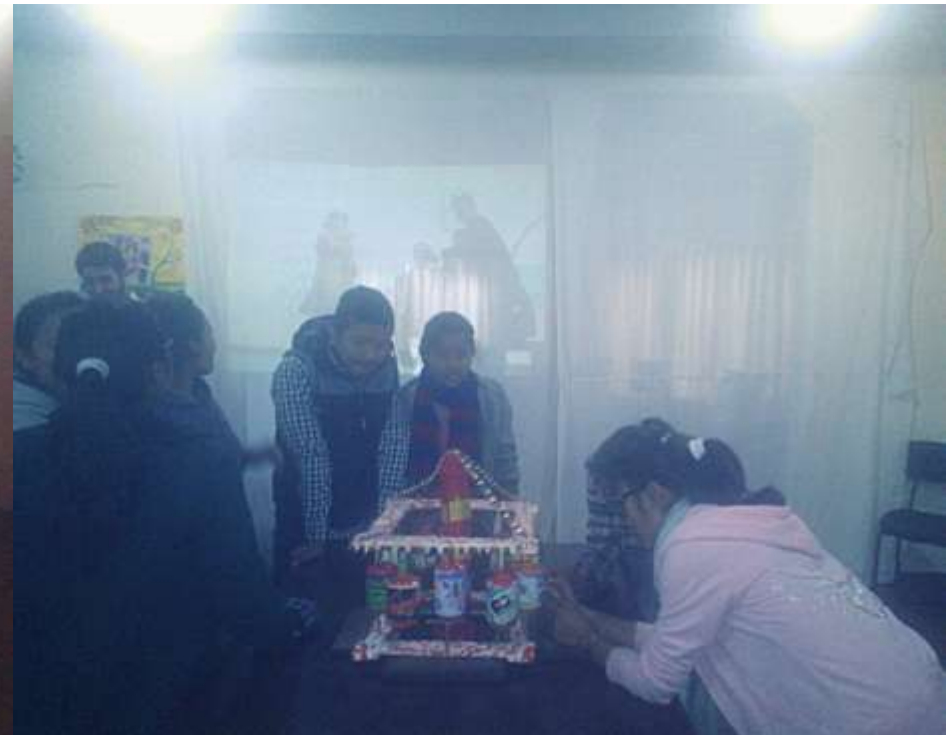
Students from Srongtsen Bhrikuti attend the exhibition at EduLift