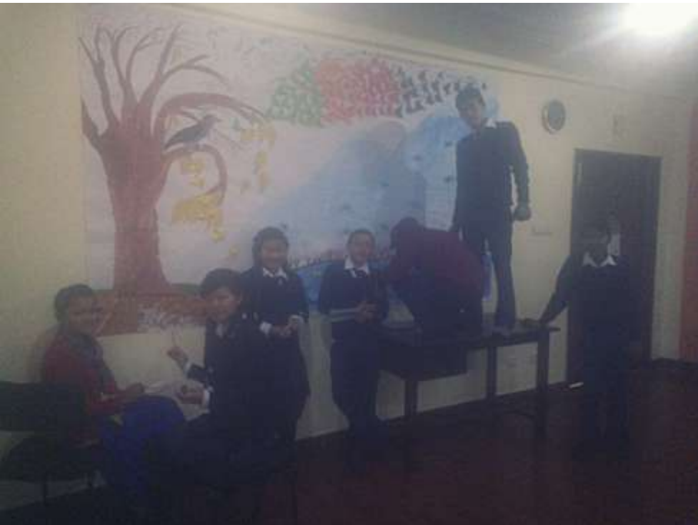
Mahendra Boudha students putting the final touches to their wall art- Butterflies' message

The Art & Design course concluded with a private exhibition of the students' work among students enrolled in the Art & Language program from Srongtsen Bhrikuti. Students from Mahendra Boudha created individual collages and a collective work of mantra wheels depicting their wishes and hopes. Both the projects were made with recycled materials. Finally, a large wall art titled Butterflies' message was created using poster colours and origami.