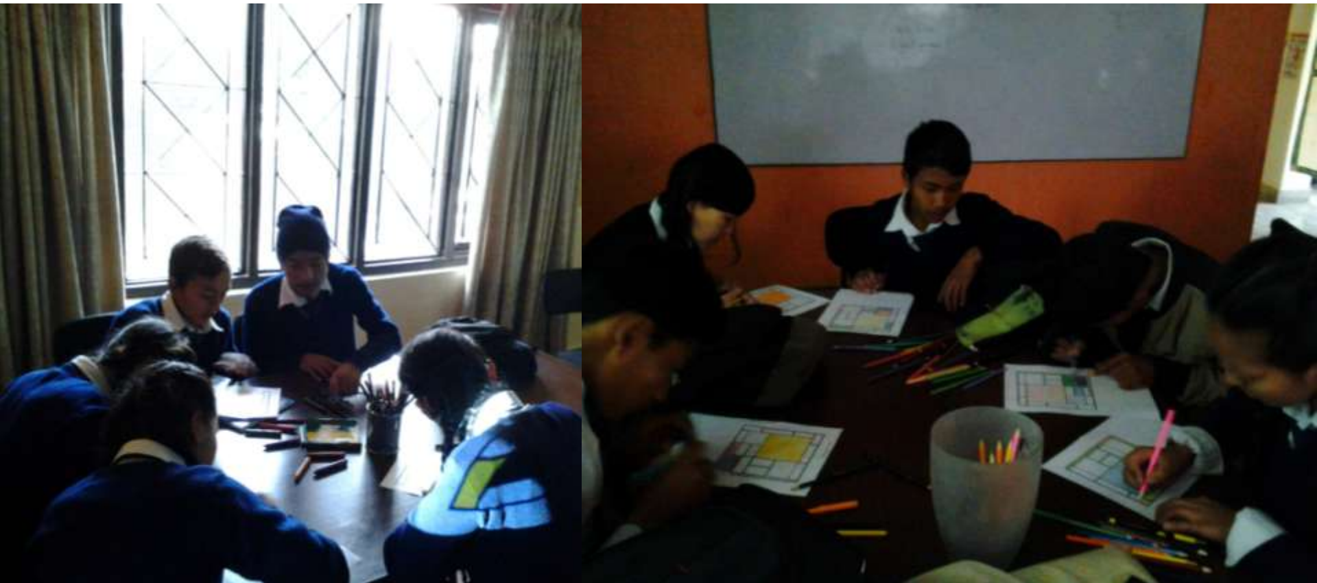
Students on the first day of art & design course associating colours with shapes.

Students from Mahendra Boudha began their fourth course – Art & Design on December 1 st . Art & Design is yet another pilot course under the Art & Language program that aims at developing language skills through visual design and expression.