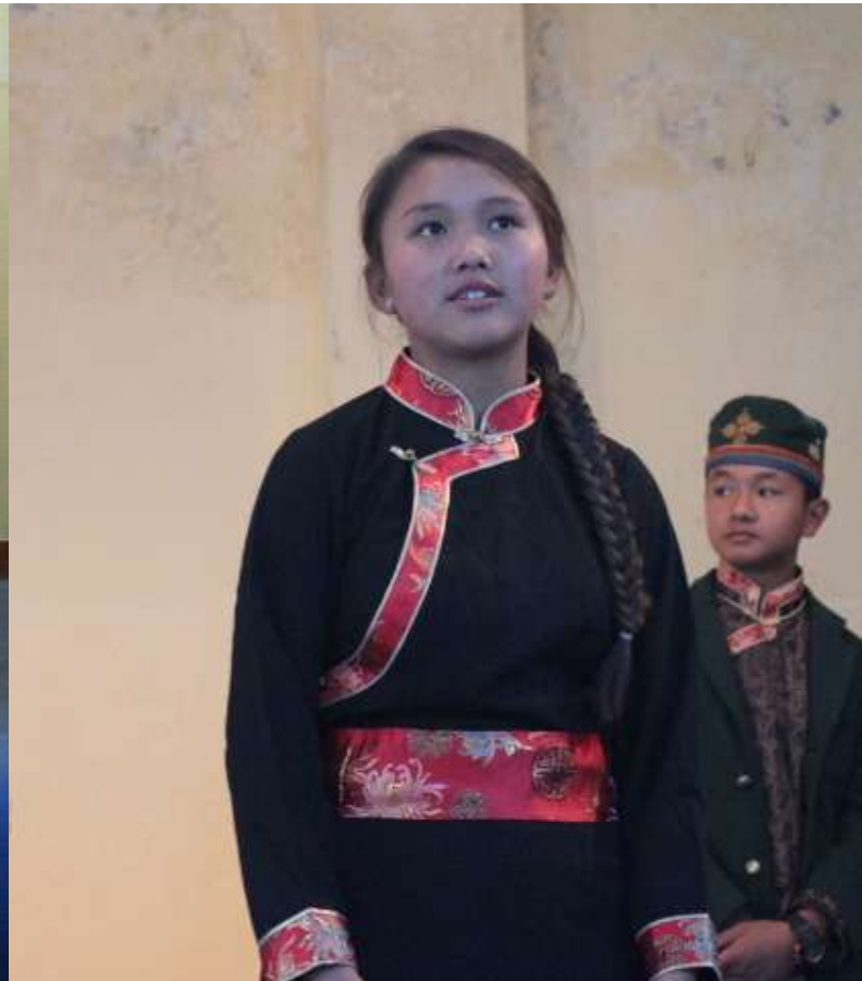
Students from Srongtsen Bhrikuti during the drama- Welcome to Oslo