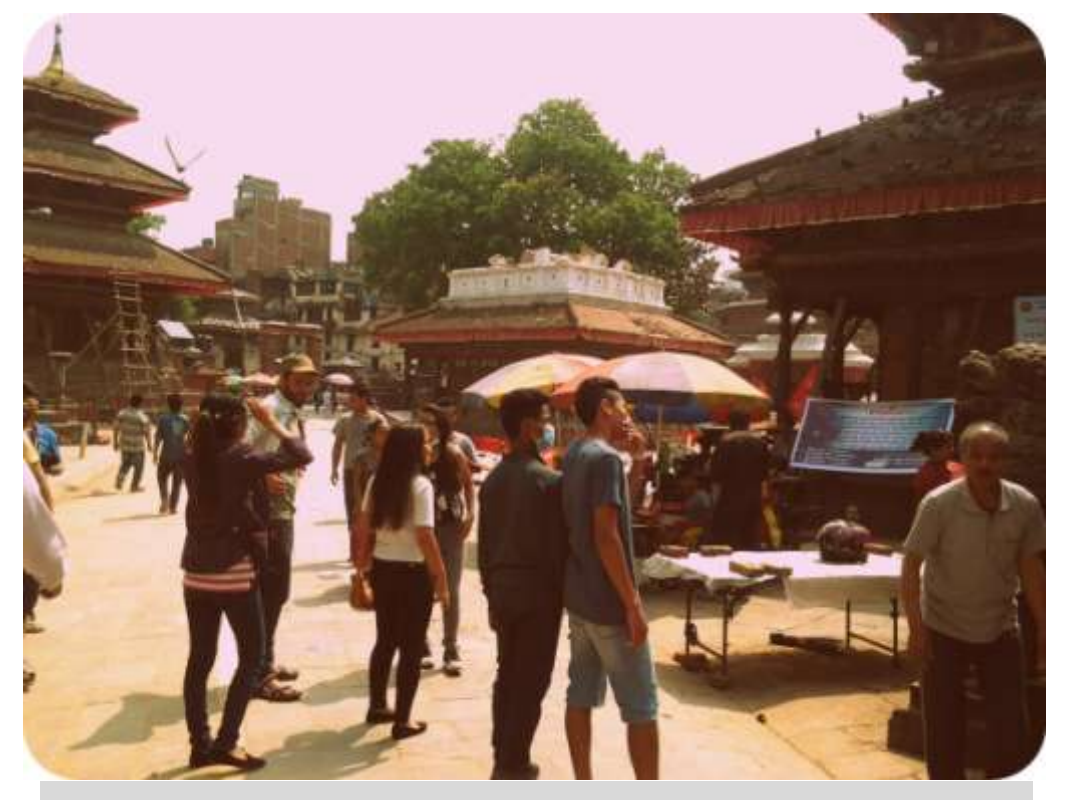
Students explore the square. For many, it is their first visit after the traumatic earthquakes in April and May.