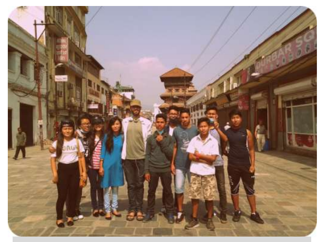
Group photo of second batch of Explore After SLC with the EduLift team in front of Basantapur Durbar Square.