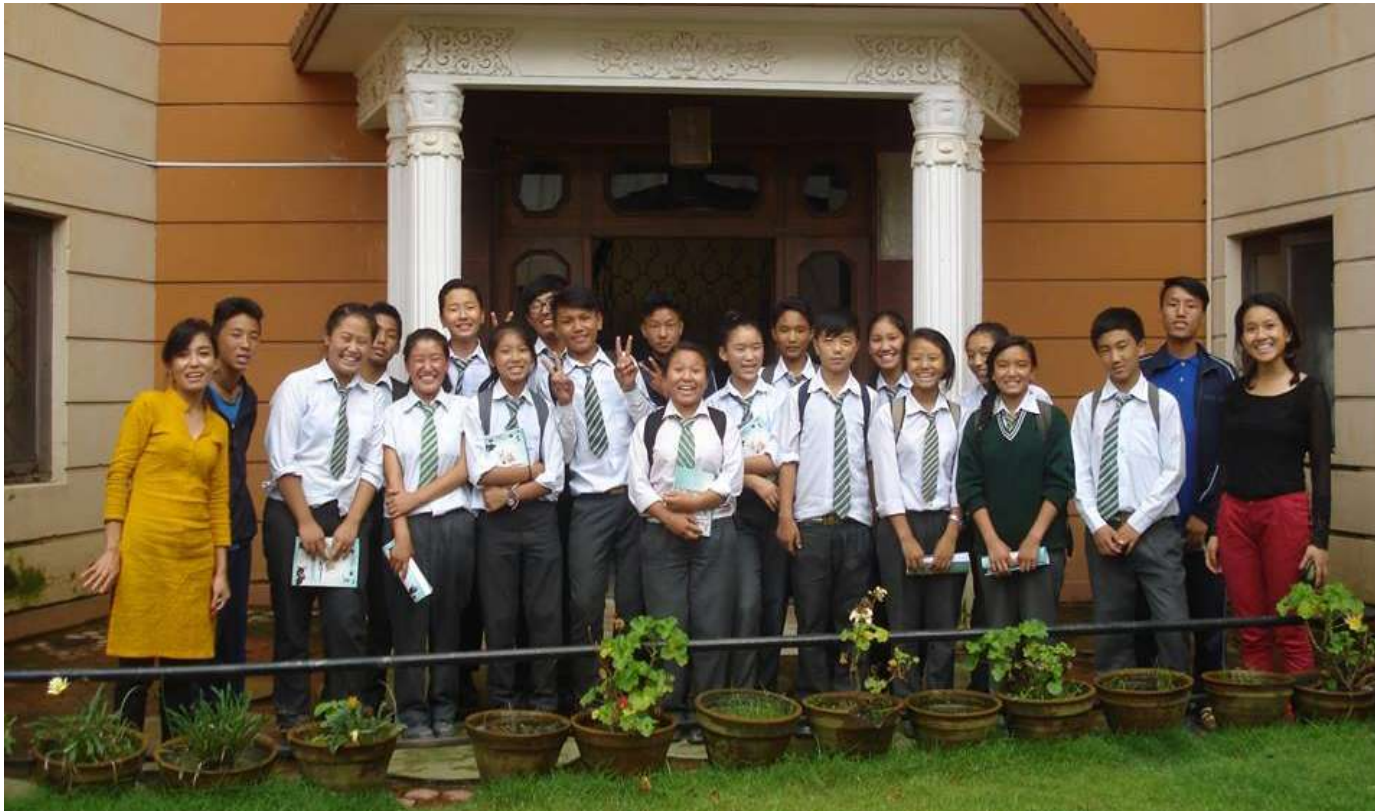
With class 8 students from Srongtsen Bhrikuti Boarding School

Art & Language program 2015 kicked off with the Art & Design course among two groups of 20 students each from Srongtsen Bhrikuti and Namgyal Higher Secondary School on 18 th August. The course aims at improving English language skills among other necessary skills of creativity, collaboration and communication skills through Art & Design sessions.