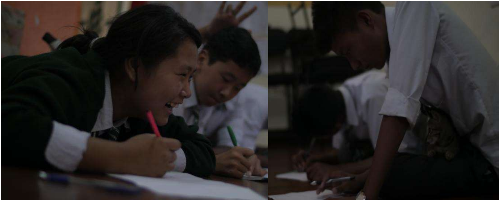
Students in the class expressing their emotions through drawings!

In lieu with our previous year's aim to incorporate Nepali students into our programs, the Art & Language program has also been extended through early morning sessions to Grade 9 students from Shree Mahendra Boudha Higher Secondary School and Kumari English Boarding School. These students were chosen on the basis of their passion and willingness to learn and exercise their creative muscles.