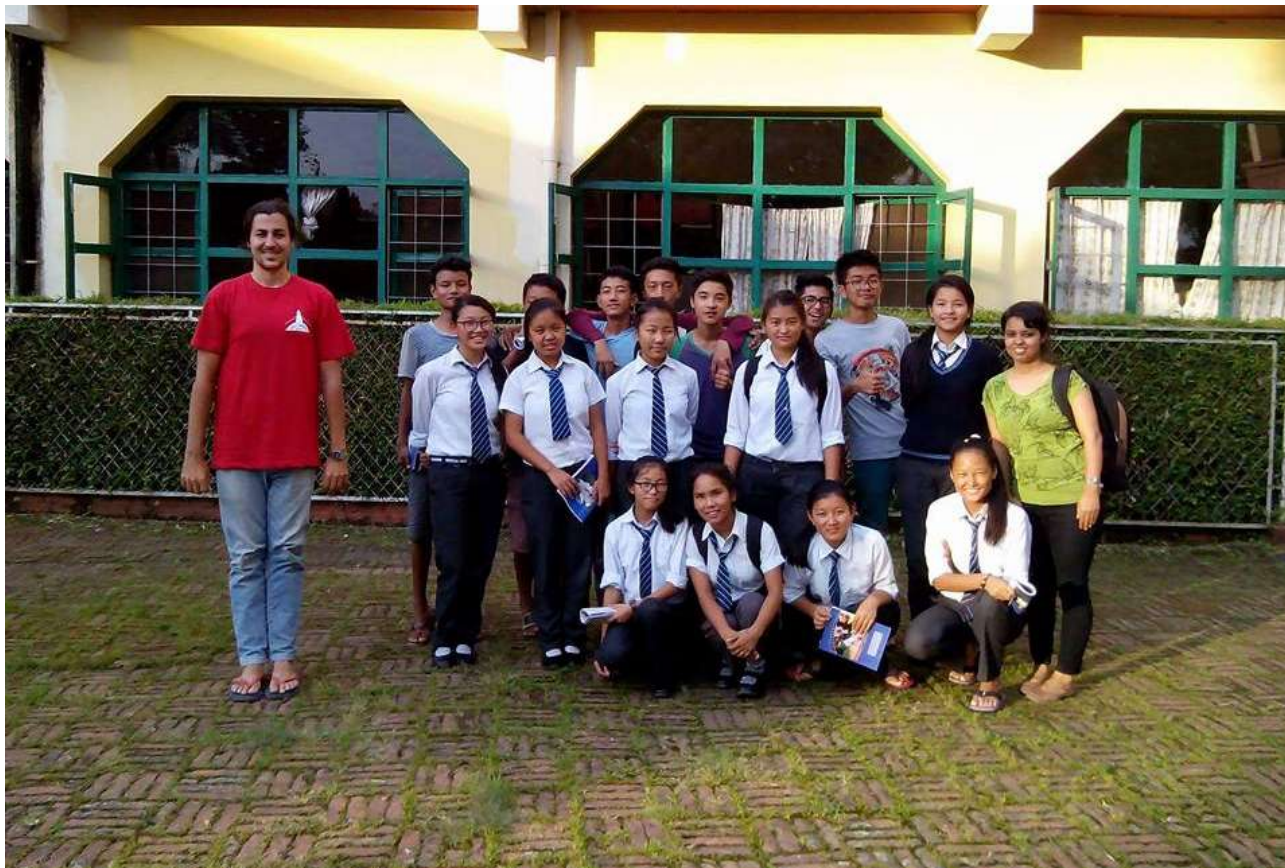
EduLift facilitators with class 8 students from Namgyal H.S.S.

Students were guided towards building individual pieces that express their personal interests and dreams as well as work together in group projects towards describing their larger realities. They were encouraged to constantly use their hands for designing as well as come up with different materials not used in their classrooms before. The course concluded with a final event where the students' works were exhibited to an audience.