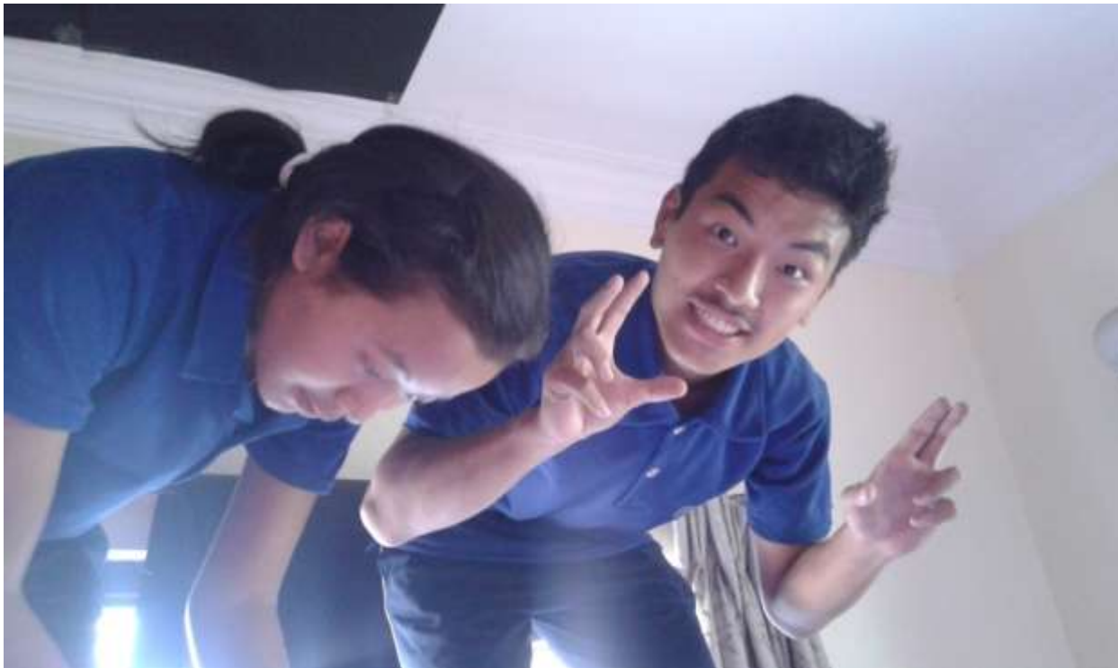
Students working on their final design pieces

The Final Art and Design event is set for October 9 th with the students from Srongtsen Bhrikuti Boarding High School, October 13 th with the students of Namgyal H.S.S and October 19 th with the students of Mahendra Boudha and KEB school. The final event will showcase the designs of students that have been created both individually and in groups. The Art and Design course prepares students to make designs that express their reality through an actual outcome (design piece) and most importantly will enable them to openly and effectively engage others through their artistic efforts.