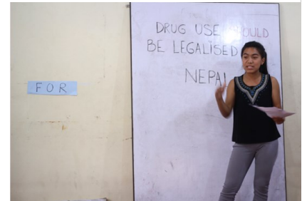
Students debating on whether "drugs use should be legal or illegal in Nepal"