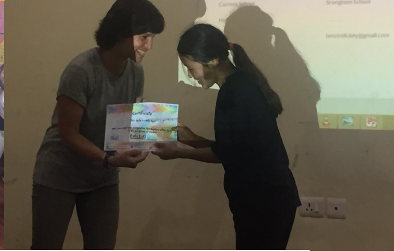
4th Batch of “Explore After SLC” Students receiving certificate during Finale