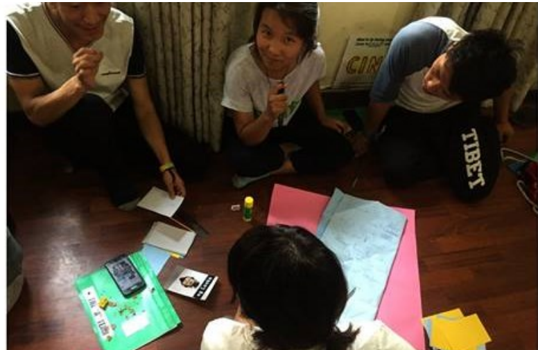
Students are creating poster, logo and exploring world of graphic design through HEAD , HEART and HAND.