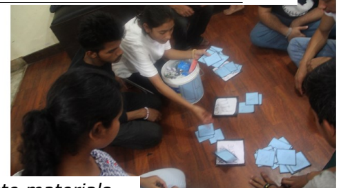
Students are creating recycle products from waste materials