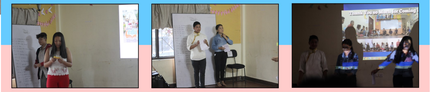
Group wise presentation on entrepreneurs of different sectors.