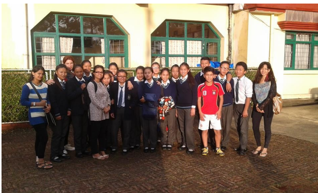
Poetry students at Namgyal high school

This course stemmed rather spontaneously when the facilitators felt the need for a course that would prepare the students for the Spoken Word Poetry. This course was developed keeping four critical