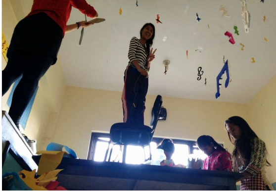
Students collaborating on their final design piece at Edulift