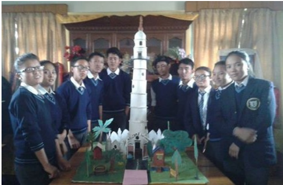
Students of Namgyal high school with one of their final design piece