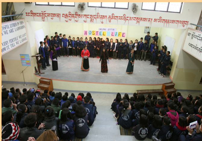
Drama- final Event at Srongsen School

Each course is completely immersed in one particular art form. For example, in our Drama & Language course, students further their English language skills everyday through performance and enactment. Students learn the language with the support of that art form unlike regular English classes. Hence, students find themselves understanding that particular form of art and appreciating it while learning language. As the courses progress, students will be trained and enabled to use language not just as simple texts but as a tool for self expression, to tell their stories, or to share their messages across. Being able to use language in that way makes it a life skill that they could use to gain further opportunities. Due to the dynamic nature of each course, by the end of the program each student will have contributed to creating a poem, a story, a play, a design or even a video which will only establish a certain confidence of creativity and potential in each participant.