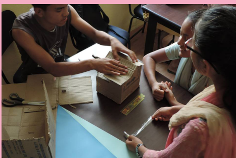
Students creating products from waste materials