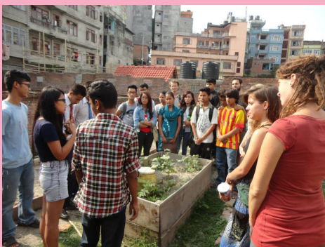
Students examining a local waste management project.